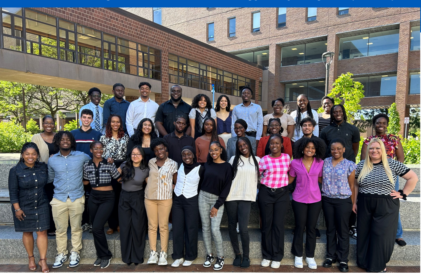
2024 CSTEP Research Interns at University at Buffalo- School of Management

Collegiate Science & Technology Entry Program (CSTEP)