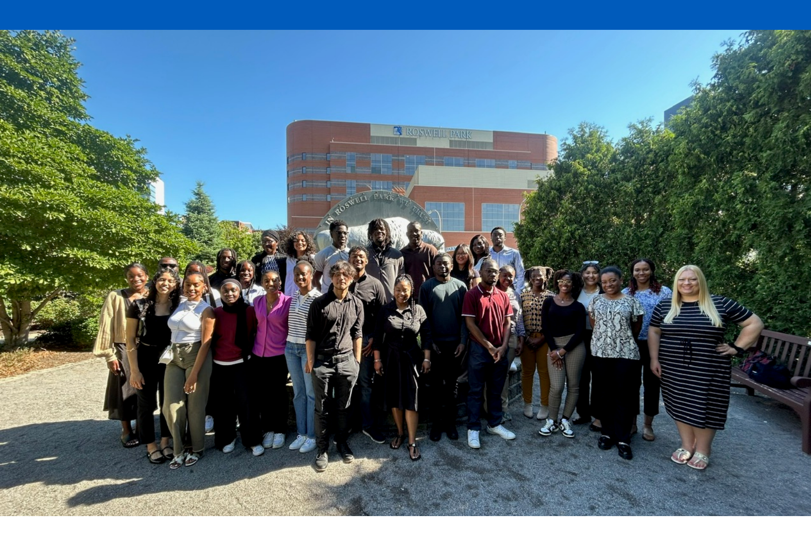
2024 CSTEP Research Interns at Roswell Park Comprehensive Cancer Center- Education Building